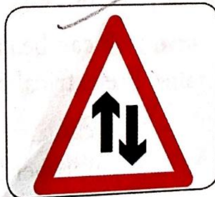
two way sign