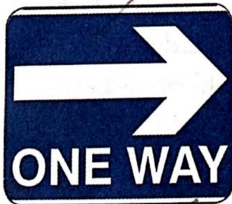
one way sign