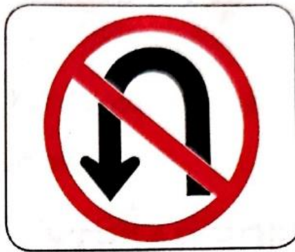
no u turn