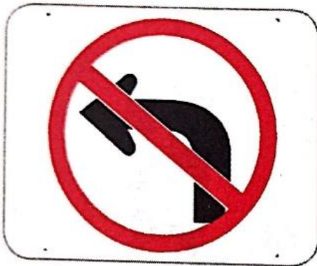
left turn prohibited